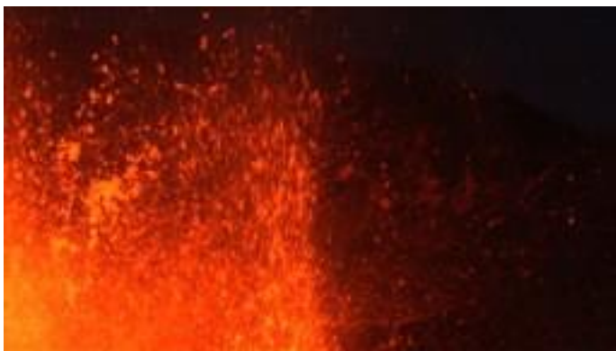
"Gaia Breathing" "Gaia in Action" by Sigrún Harðardóttir 3 min and 3 min, 2011

This is a story of a man walking through a snow covered landscape. From a bird's eye view, we can only see some individuals carving a track in the snow and then some more, and finally a group that follows in their footsteps. The group expands sometimes to a crowd and later consists of only single individuals. They are passing together through an anonymous landscape, trying to find the right direction on his journey.