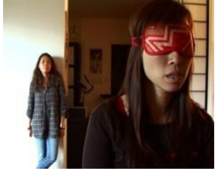
'THEN WHAT' by Nina Lassila 2009, 8.43 min.

I write a script about my process and create a video. This time the result is somewhat similar to a documentary.