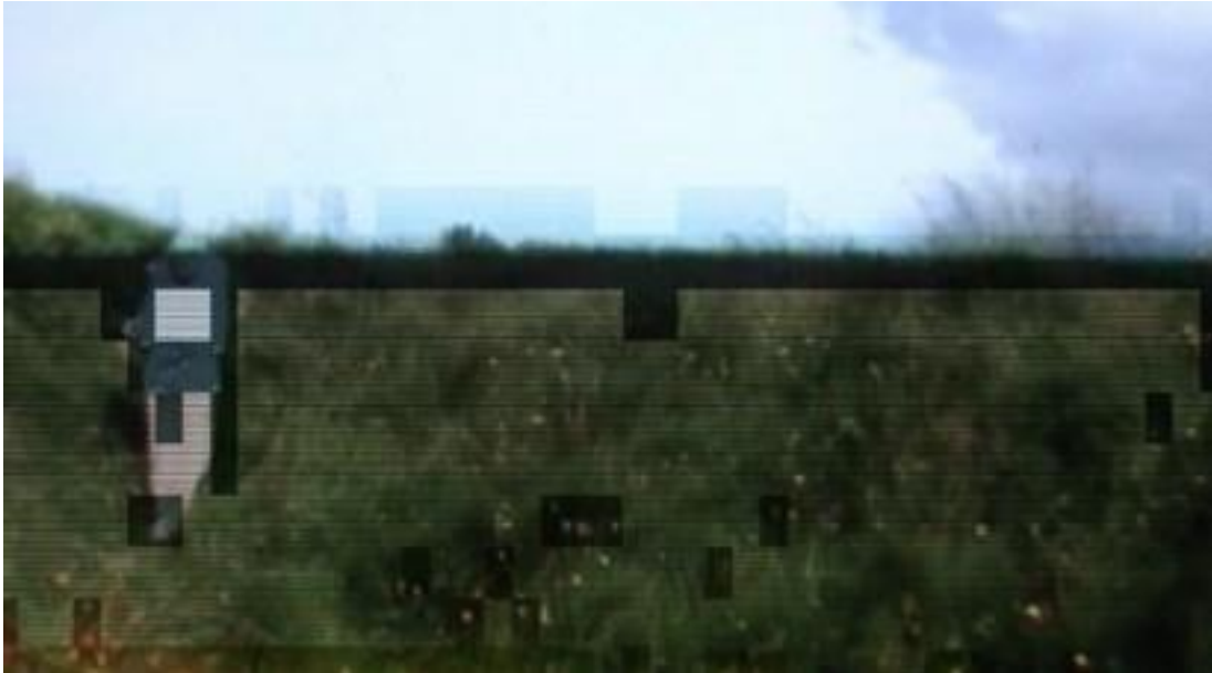
"Sveitagong" by Kristín Scheving (Countrygong), 2015, 2.12min

Sveitagong is a reflection on inner peace through and with nature and sound. Passing sounds of gong with sounds of digital glitches make you think of repeating memory from the past. What is a real memory and what is a made memory.